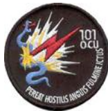
101st Gruppo OCU Amendola Air Base - LIBA Callsign: LAMPO AMX-T (ACOL)