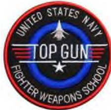
United States Navy Fighter Weapons School– Top Gun Callsigns: TopGun 2 & Ghost rider Aircraft: F-14A